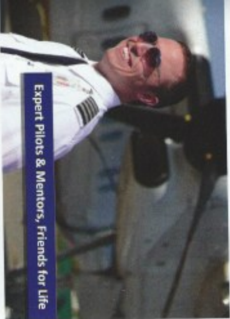
Expert Pilots & Mentors, Friends for Life

Our fleet is equipped with state-of-the-art technology, including dual Universal FMS computers, and the Rockwell-Collins Heads-Up Guidance System (HGS).